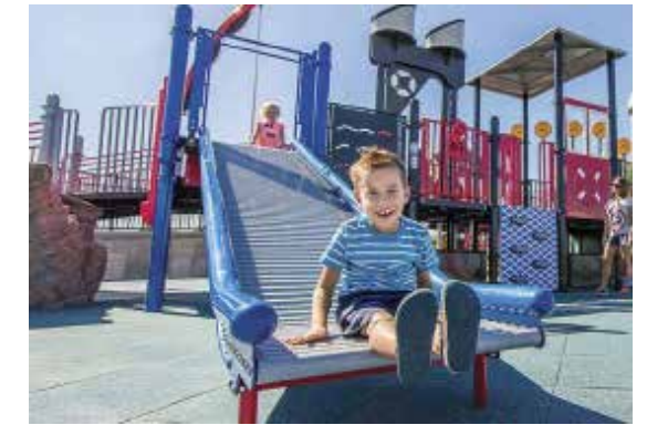
ROLLER SLIDE | $15,000