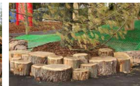
AMPHITHEATER | $32,000