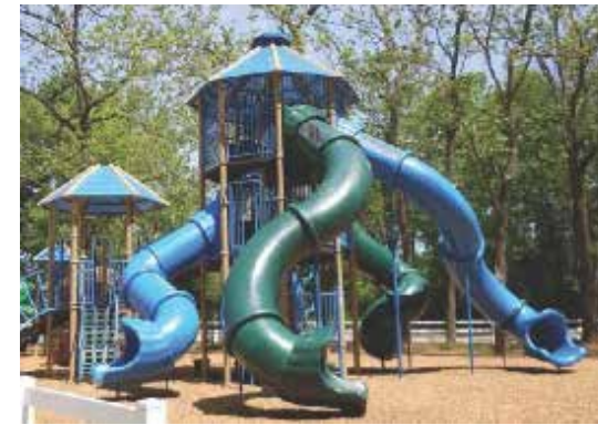
TUBE SLIDES | $25,000 ($12,500 each)