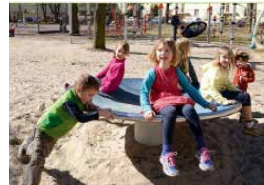
GROUP DECK SPINNER | $25,000