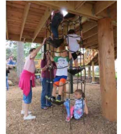
VERTICAL NETTING | $25,000