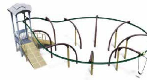
GRAVITY RAIL | $55,000