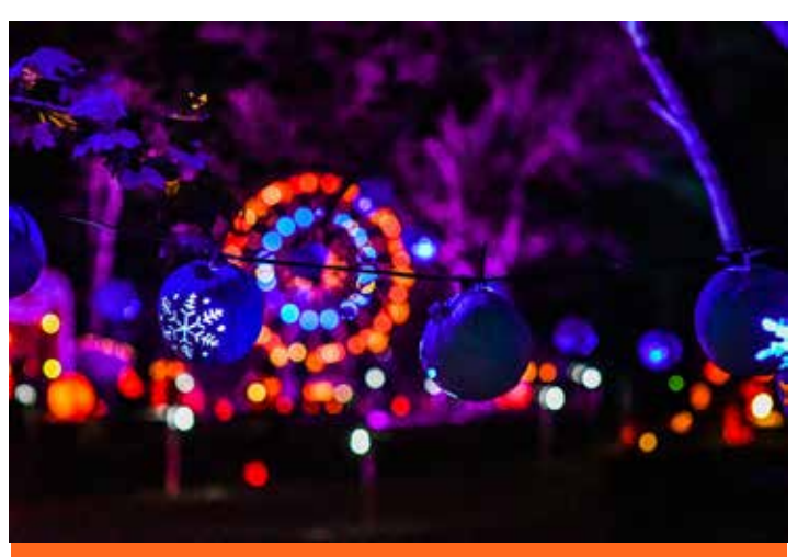
Look for Jack's Pumpkin Glow: A Pumpkin Wonderland event this October at the playground. A sensory friendly day is planned for Sunday, October is a park rental and is not being planned by the Play for All Playground & Garden Foundation.)

The September 21 event replaced the July Play Day that was cancelled due to the extreme heat. Thank you Canine Companions for Independence, Kidlist and DuPage Medical Group for providing the fun.