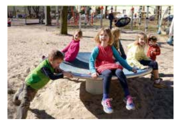
GROUP DECK SPINNER